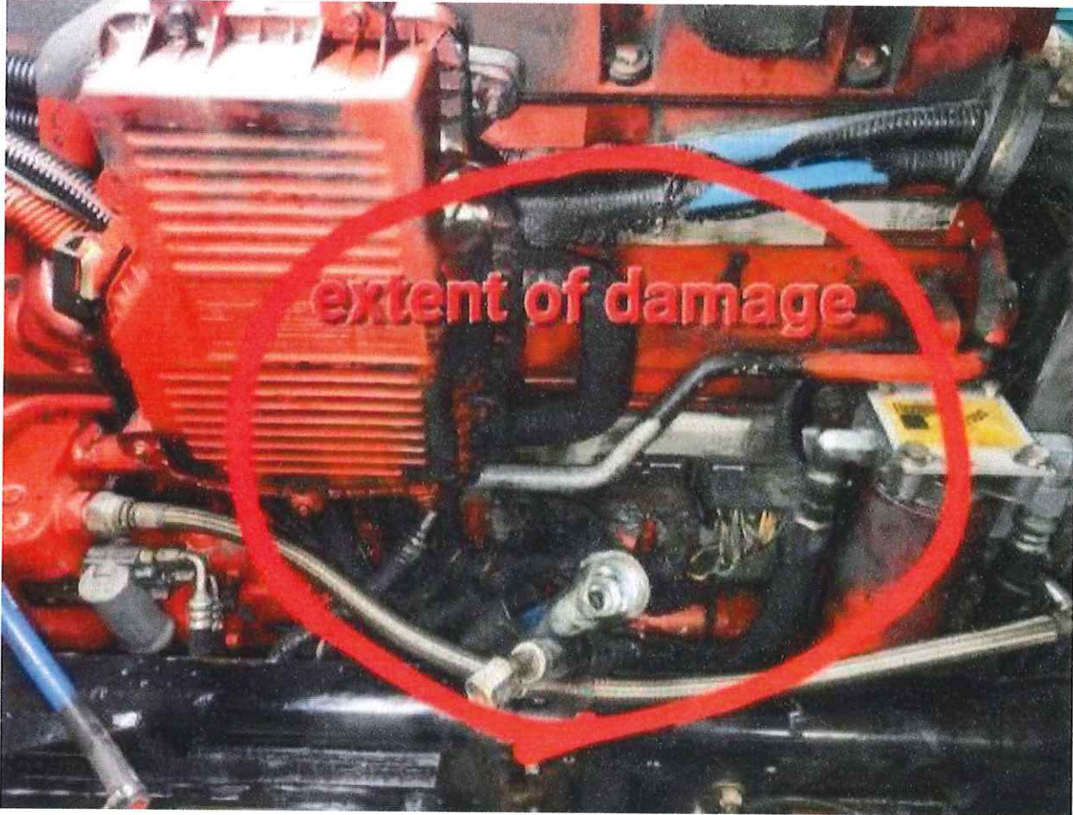
Picture of fire damage and breakdown of additional repair items attached.